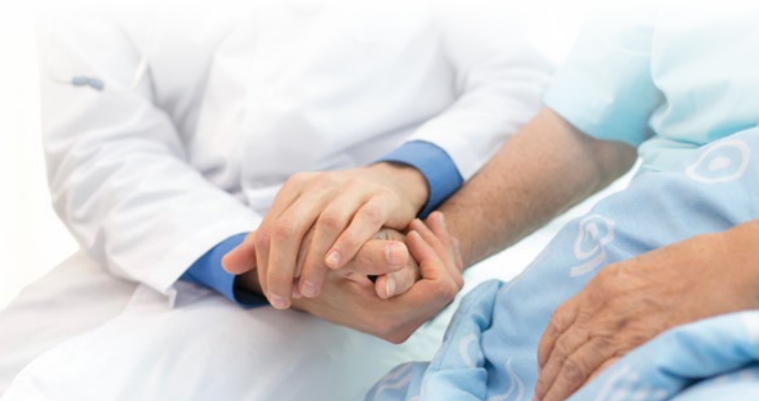
Colorectal Cancer Care Package